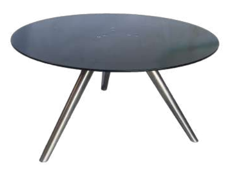
Cone Low Legs

Height: 41cm Material: solid aluminium Finishing: polished