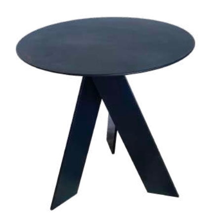
Flat Cross Legs

Height: 41cm Material: steel Finishing: matt black powder coating