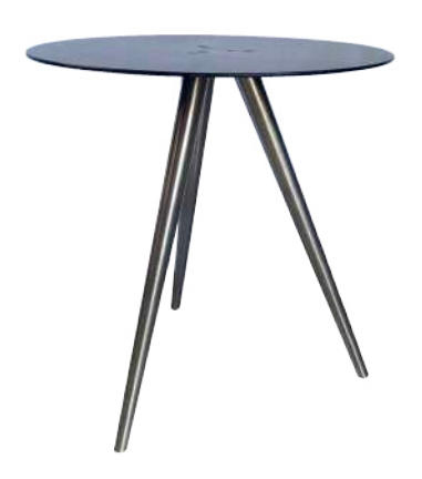
Cone Tall Legs

Height: 41cm Material: steel Finishing: matt black powder coating